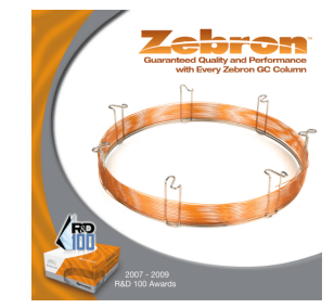
Products used in this application:

Carrier Gas: Constant Flow Helium, 1 mL/min Injection: On-Column :1 1 μL @ 153°C Detection: Flame Ionization (FID) (400°C) Analyst Note: Sample was 1% in dichloromethane