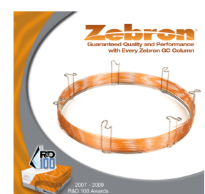
Products used in this application:

Analyst Note: The pariffins standard was first diluted 100:1 in pentane and then run with a 40:1 split to avoid column